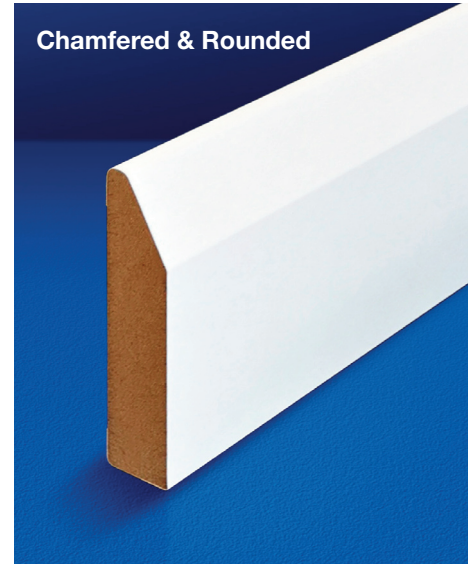
Chamfered &amp; Rounded

StreWrap® offers a perfect labour saving solution for architrave and skirting profiles. Requiring only one top coat finish, StreWrap® effectively reduces site time and labour costs.